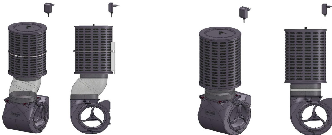
A. MOUNTING WITH EM ADAPTER